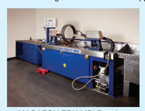
MAGAZON EBU MPI Benches ideal for testing large components